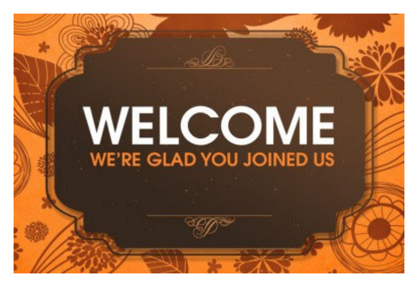
Welcome to St. John's Church