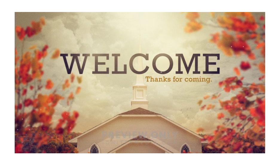
Welcome to St. John's Church