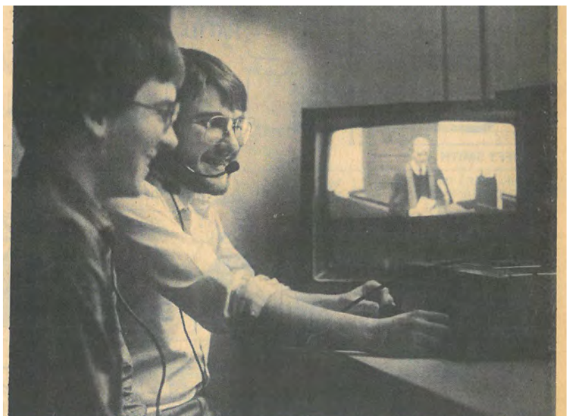
In the booth